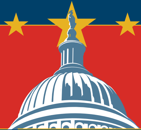
EXHIBIT & SPONSORSHIP PROSPECTUS

APRIL 23-26, 2017 | MARRIOTT WARDMAN PARK | WASHINGTON D.C.