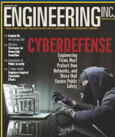
Engineering Inc. Award-Winning Business Magazine