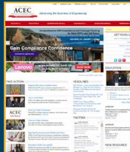
ACEC Website www.acec.org