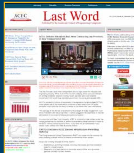
Last Word Weekly e-newsletter