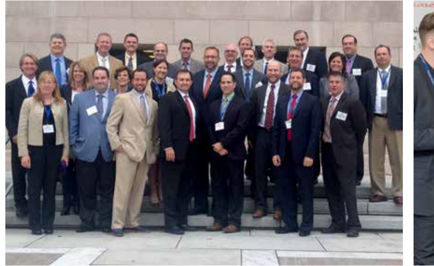
ACEC's Senior Executive Institute (SEI) Class XXI on Capitol Hill.