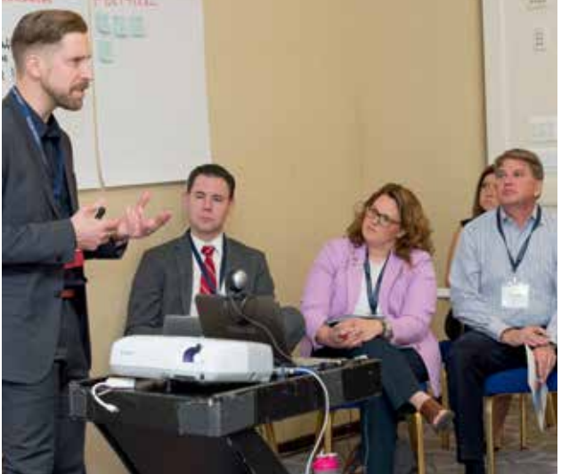
ACEC's Emerging Leaders Forum and Pathways to Executive Leadership Program.

"In engineering school, you don't learn about business, about public policy, about communication—or about marketing or strategic planning. All of these are necessary to run an effective business, and ACEC provides excellent, cost-effective training in these areas."