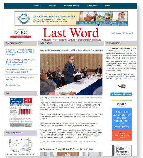
Last Word Weekly e-newsletter