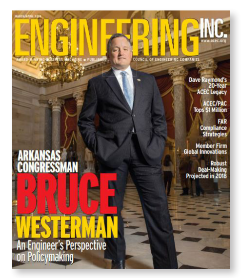
Engineering Inc. Award-Winning Business Magazine