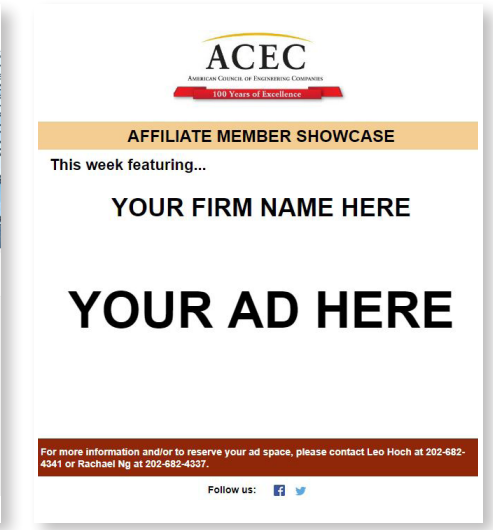
Weekly Showcase Email (ACEC Affiliate Member Only)