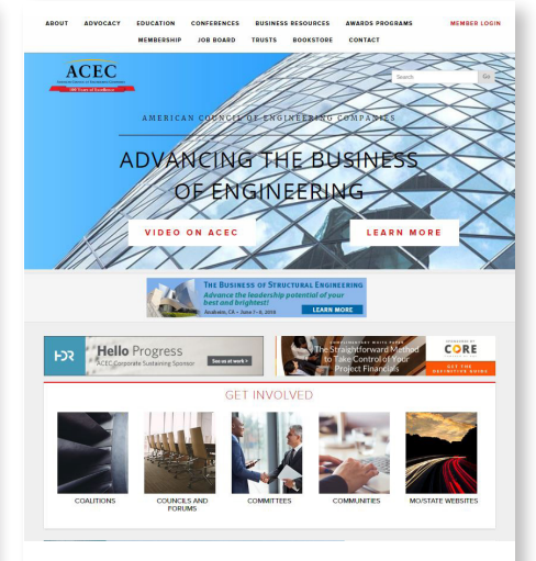
ACEC Website www.acec.org