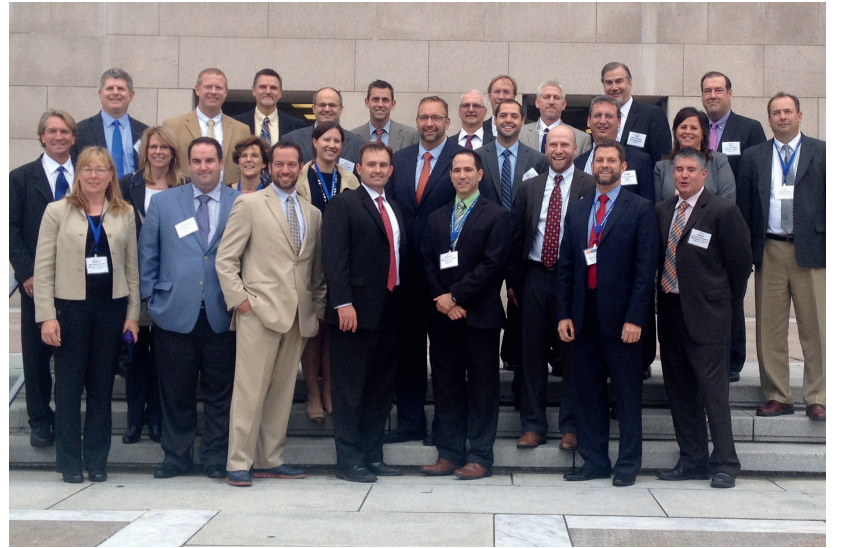
ACEC's Senior Executive Institute (SEI) Class XXI on Capitol Hill.