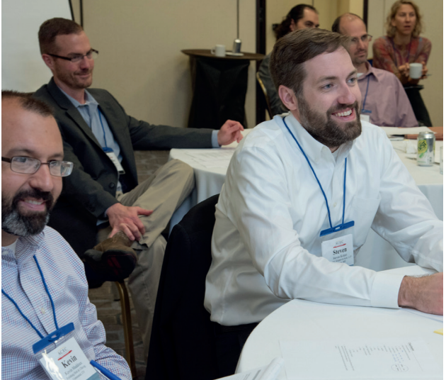
ACEC's Pathways to Executive Leadership program.

"In engineering school, you don't learn about business, about public policy, about communication—or about marketing or strategic planning. All of these are necessary to run an effective business, and ACEC provides excellent, cost-effective training in these areas."